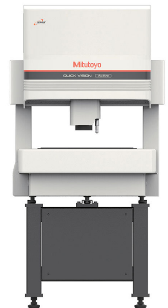
QUICK VISION Active 404